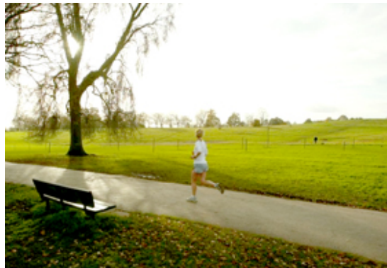
Exchanging gym membership for fresh air

Exercise has also taken on a greener valence for me. In America, membership at health club was routine. But on a London budget it was the first thing to go. My health club is now Hampstead Heath, a large, hilly park near my home. True, if it's been raining – and despite global warming, this is London – my run is broken up by intermittent periods of mud sliding (I've come to think of this as a form of interval training). But at least I can rest easy knowing that I did not deface Mother Earth to make way for another elliptical machine. Plus, on any given day, it's possible I'll collide with some unusual form of wildlife (foxes, rare birds, George Michael); what's not to love?